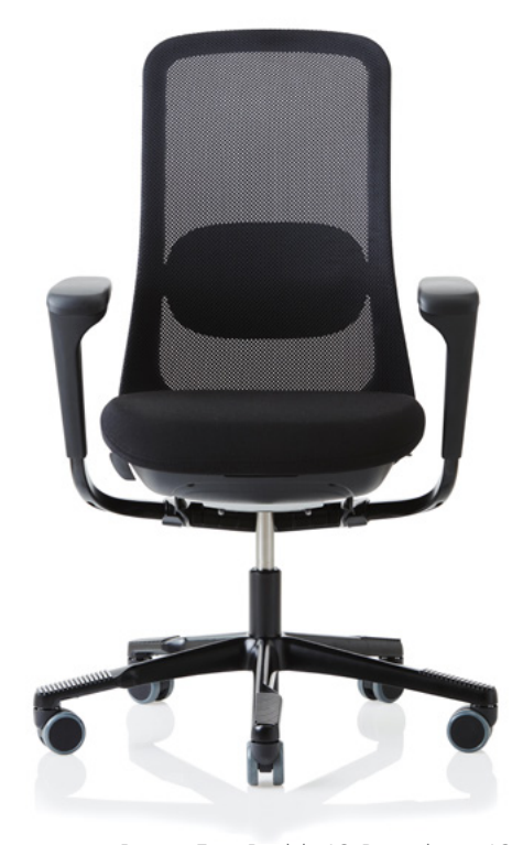
Design: Frost Produkt AS, Powerdesign AS and Flokk Design Team Patent- and design protected

Adjustable armrests (height and width) with or without the unique H\mathring{A}G SlideBack ^{\text{\tiny{M}}} function and headrest are optional extras.